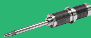
Actuators & Feedthroughs