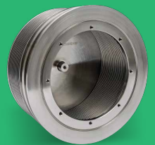
Seals & Membranes

+ Hydrogen Compatible + Material Expertise