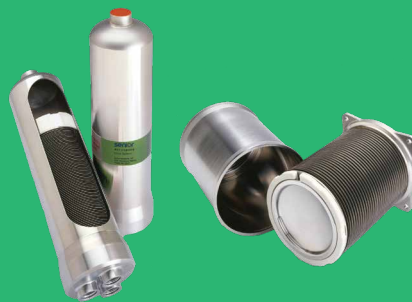
Accumulators & Reservoirs