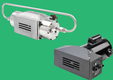
Pumps & Compressors